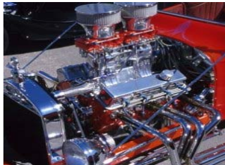
The Combustion Engine