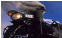
The Steam Engine