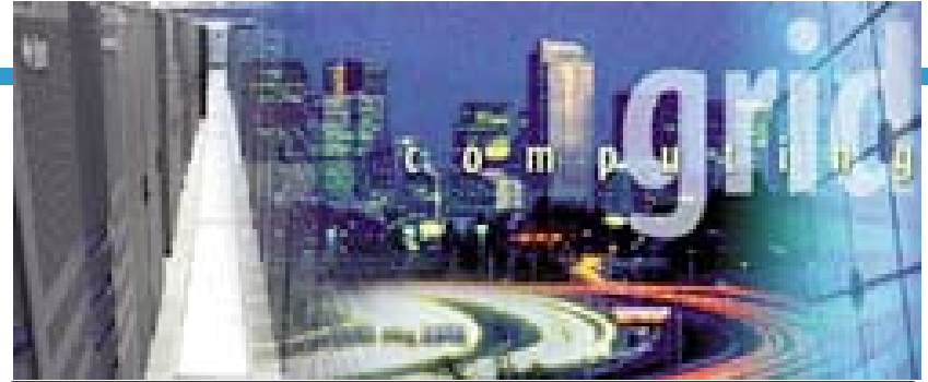
The Innovation Engine