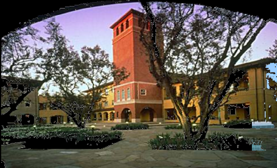
DreamWorks Animation Glendale, CA