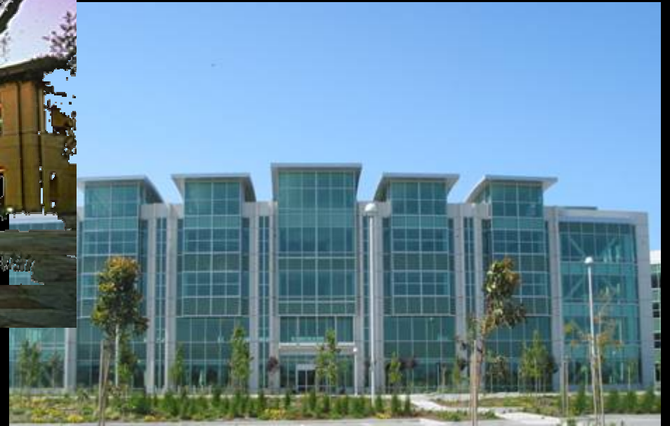
PDI/DreamWorks Redwood City, CA